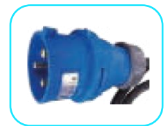
32 Amp Industrial Plug