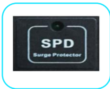
Surge Protector Module