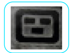
IEC - 19 Type Socket