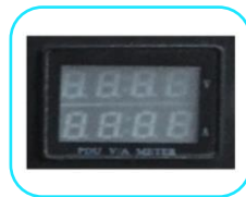
IEC-13 Type Socket