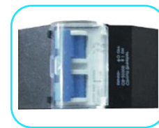
2P Circuit Breaker

2P Circuit Breaker Current & Voltage Meter Surge Protector 6mm 2 2M Power Cord 32 Amp Power Input