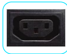
Universal Type Socket